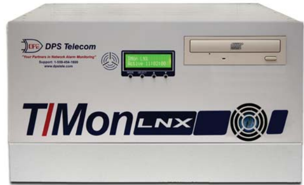
T/Mon LNX Alarm Management Platform