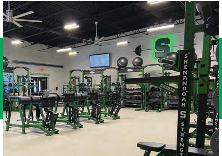
Design Build construction of new Weight Room