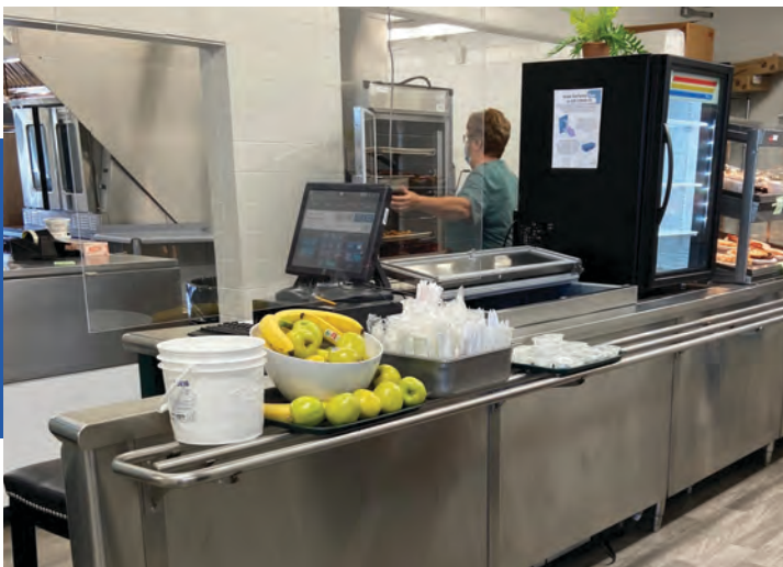
Kitchen renovations including flooring, painting, and all new kitchen equipment