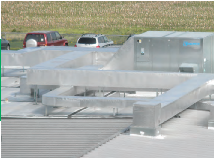
Mechanical upgrades including Energy Recovery Unit to condition outside air