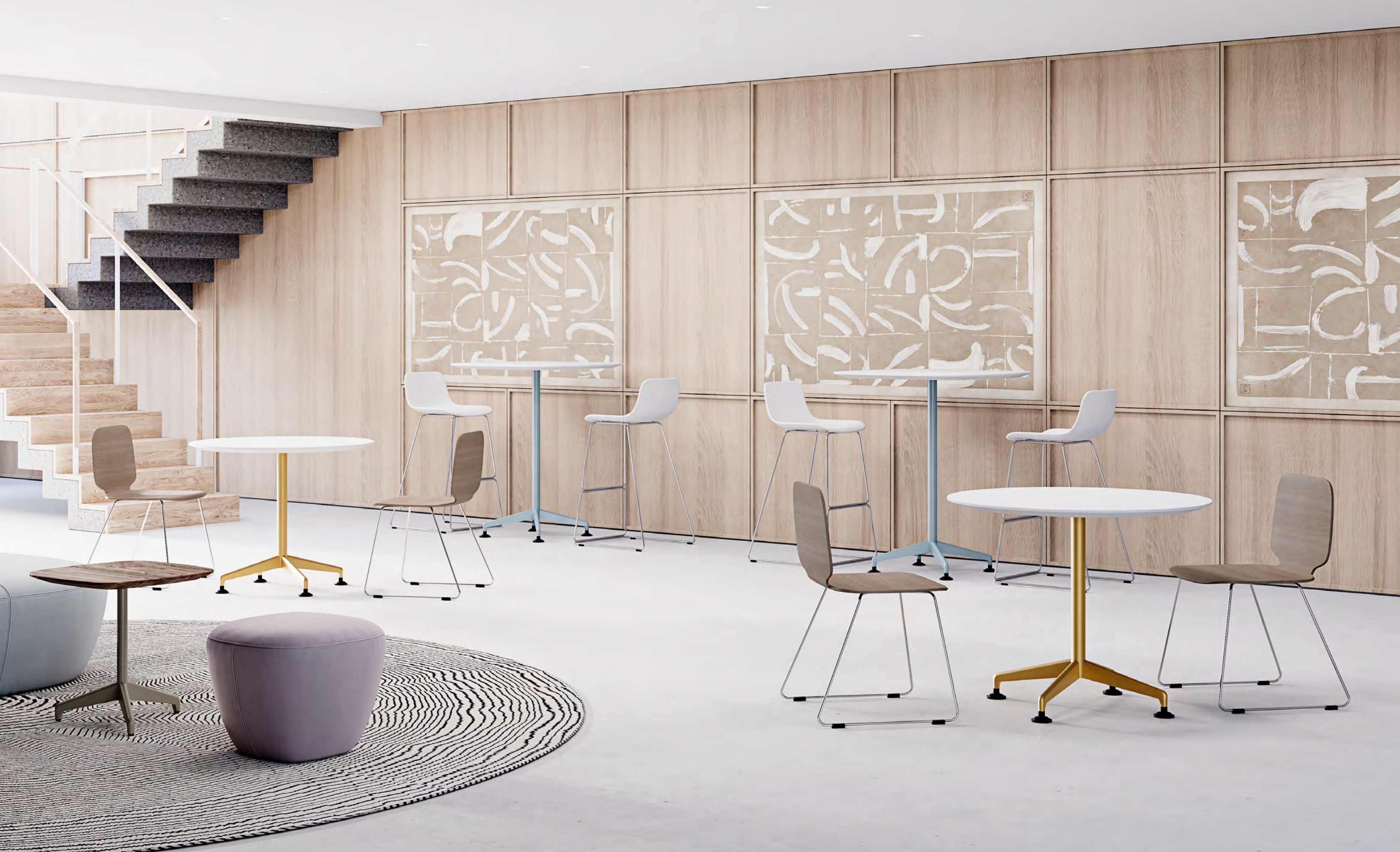
ZIA 42" H TABLES POWDER BLUE BASES | 29" H TABLES METALLIC GOLD BASES & WHITE TOPS