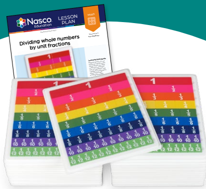
Complete Set of Fraction Tiles with Trays