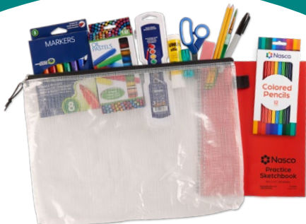
Middle School Student Art Kit with Sketchbook in Bag