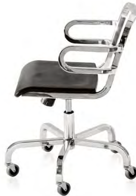
Nine-0 by Ettore Sottsass, 2008 80% recycled aluminum with soft polyurethane seat. Made-to-order.