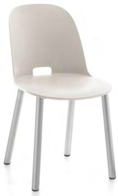
Alfi Aluminum by Jasper Morrison, 2018 100% reclaimed wood polypropylene and recycled aluminum.