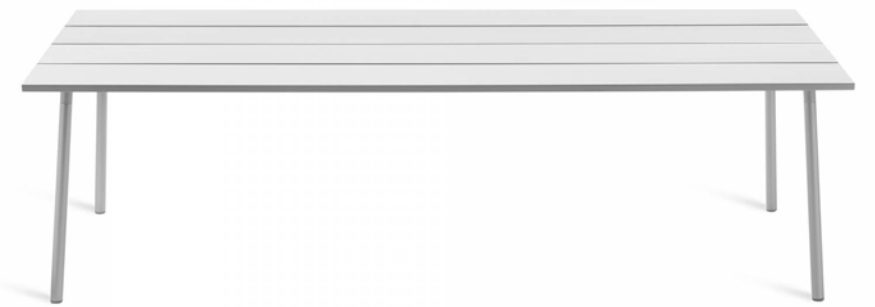
Run Collection by Sam Hecht + Kim Colin, 2016 . Recycled aluminum, ash or walnut tops; with aluminum frames.