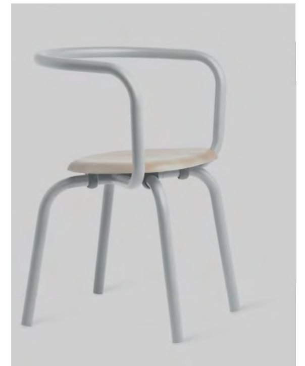
Parrish by Konstantin Grcic, 2013 80% recycled aluminum with reclaimed polypropylene, upholstered, or solid wood seat.