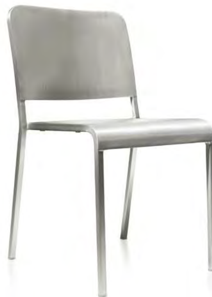
20-06 by Norman Foster, 2006 80% recycled aluminum.