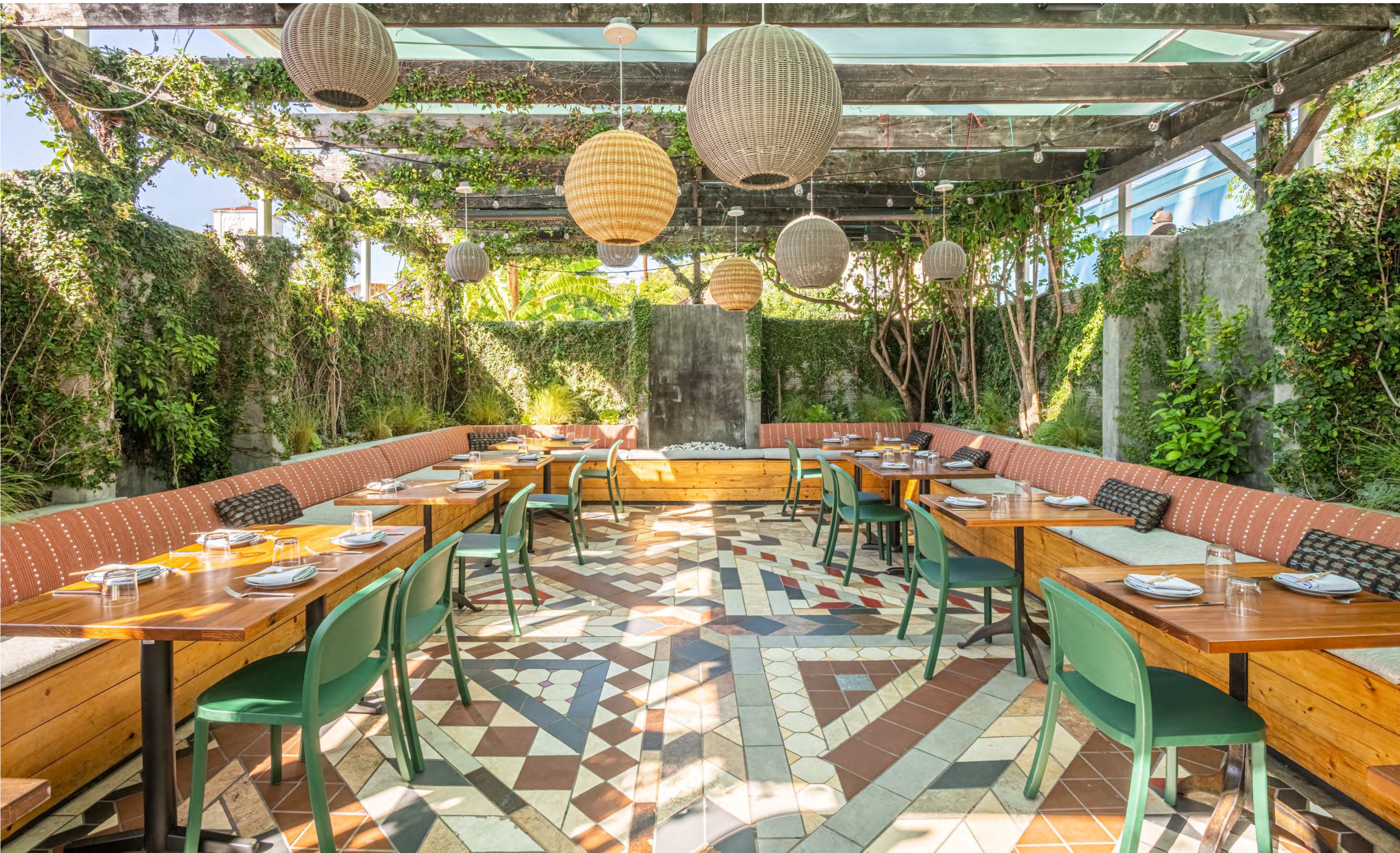
Causita Restaurant, Los Angeles Featured products: 1 Inch Reclaimed