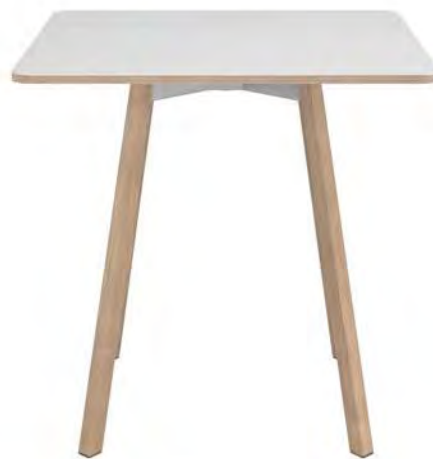
SU by Nendo, 2014 Recycled aluminum, solid wood, HPL or laminate plywood tops; reclaimed oak or aluminum frame.