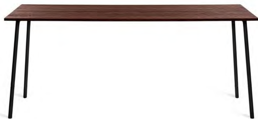
Run Collection by Sam Hecht + Kim Colin, 2016 . Recycled aluminum, ash or walnut tops; with aluminum frames.