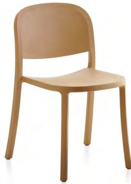
1 Inch Reclaimed by Jasper Morrison, 2018 90% reclaimed wood polypropylene.