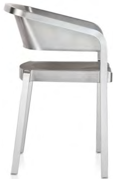
Soso by Jean Nouvel, 2012 80% recycled aluminum. Made-to-order.