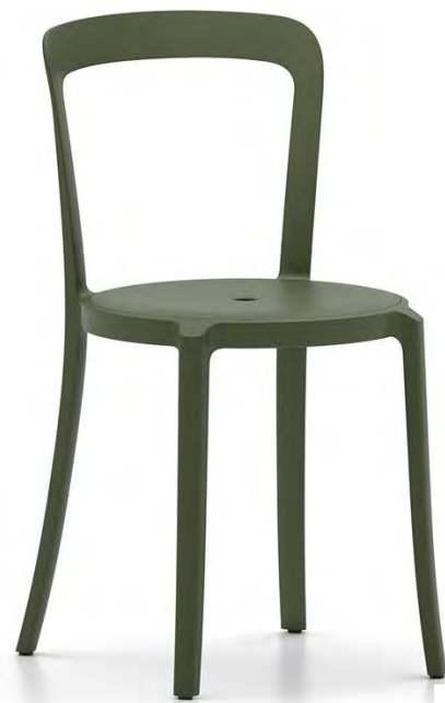
On & On Collection by Barber & Osgerby, 2019 Recycled and recyclable PET, plywood or upholstery.