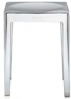
Stool by Philippe Starck, 2001 80% recycled aluminum.