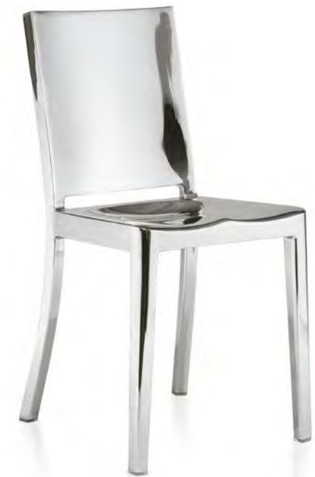
Hudson by Philippe Starck, 2000 80% recycled aluminum. Made-to-order.