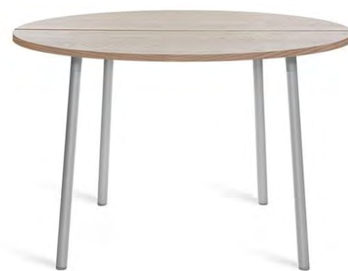
Run Round Table by Sam Hecht + Kim Colin, 2020 . Solid ash or walnut tops with aluminum frames.