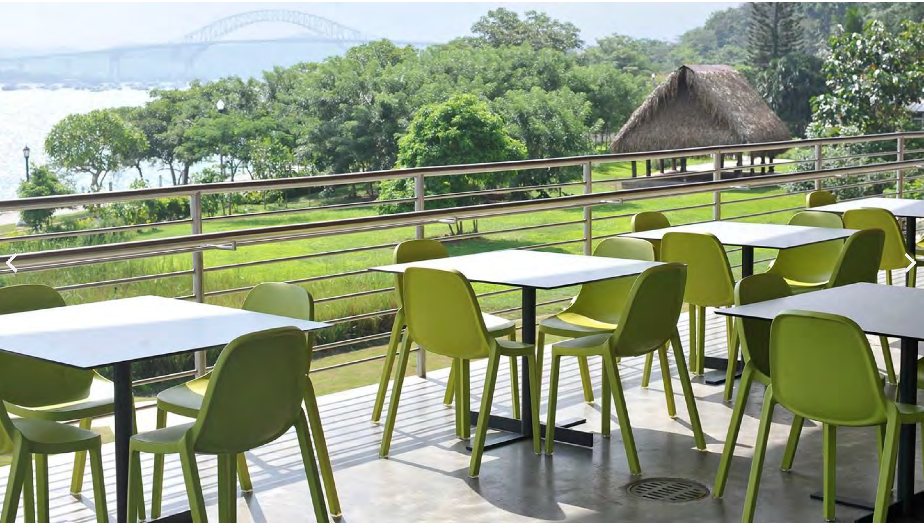
Biomuseo, Panama. By: Frank Gehry. Featured products: Broom Stacking Chair