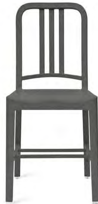
111 Navy with Coca-Cola, 2010 At least 111 recycled plastic bottles.