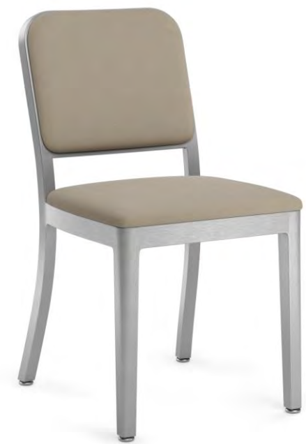
Navy Officer by Jasper Morrison, 2021 80% recycled aluminum with upholstered seat.