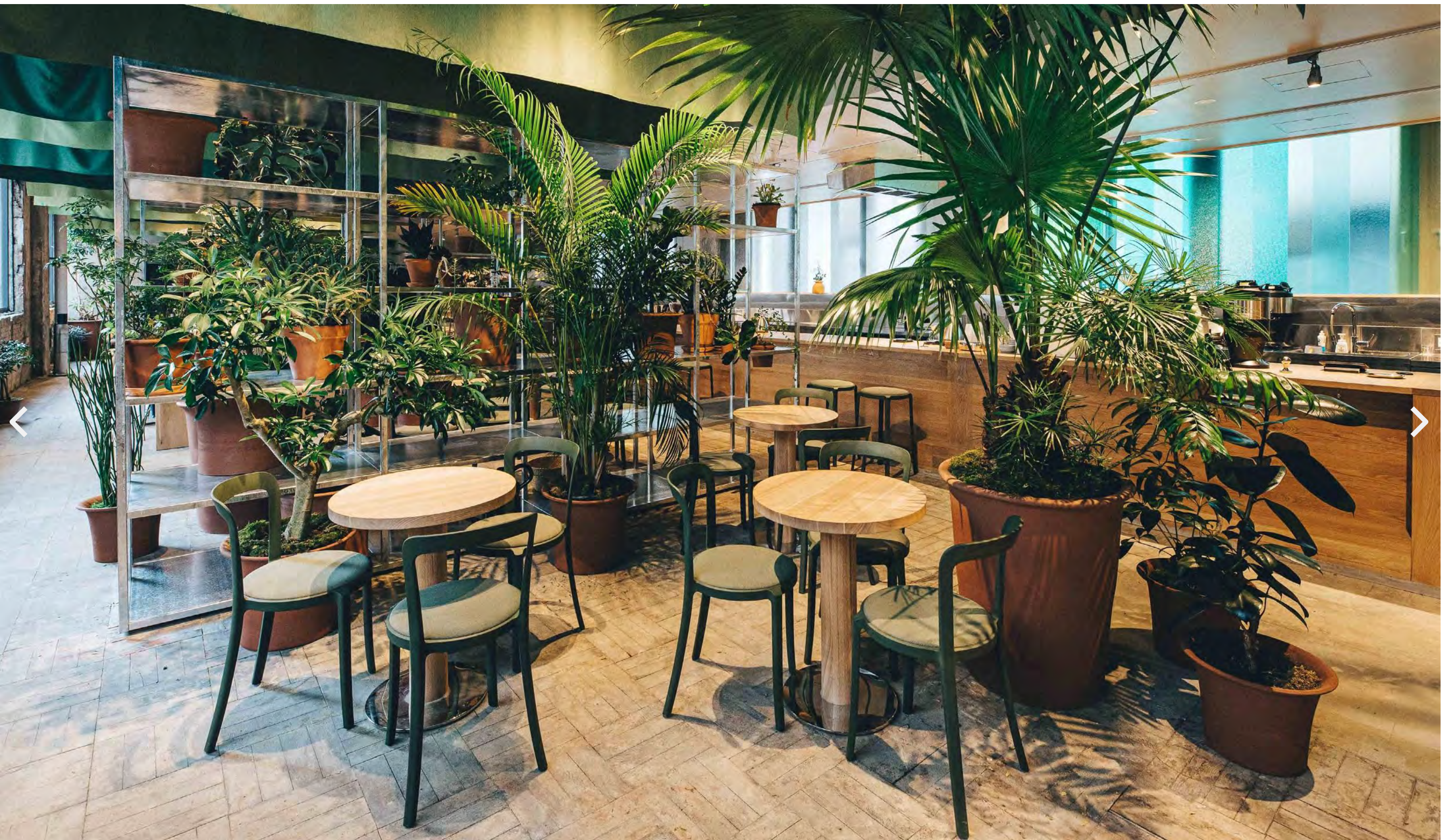
K5 Hotel, Tokyo. By: Claesson Koivisto Rune. Featured products: On & On Chair, On & On Counter Stool