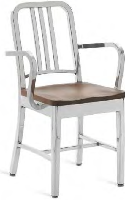
1104 Navy by Emeco, 1954 80% recycled aluminum with solid wood seat.