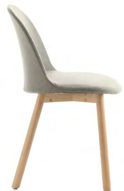
Alfi Soft by Jasper Morrison, 2018 Upholstered slipcover in fabric or leather. Removable, retrofittable.