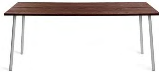
Run Collection by Sam Hecht + Kim Colin, 2016 . Recycled aluminum, ash or walnut tops; with aluminum frames.