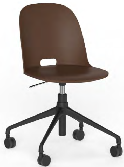
Alfi Work by Jasper Morrison, 2022 100% reclaimed wood polypropylene seat. Recycled aluminum base.