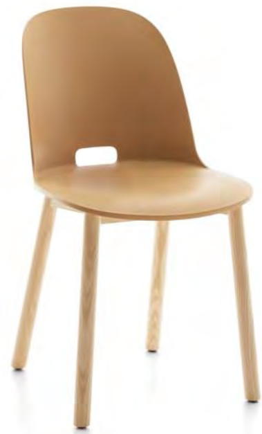
Alfi by Jasper Morrison, 2015 100% reclaimed wood polypropylene and ash wood.