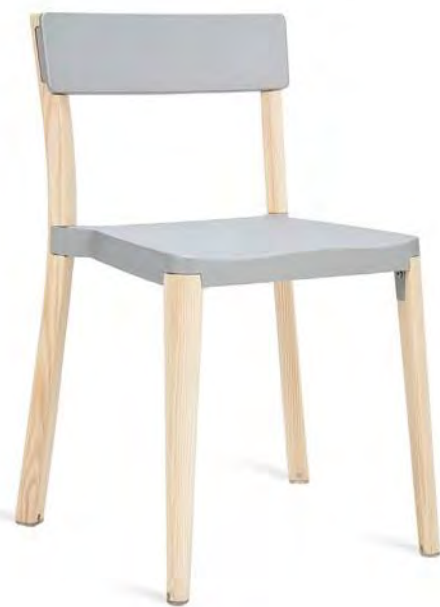
Lancaster by Michael Young, 2010 80% recycled aluminum with solid ash wood frame.