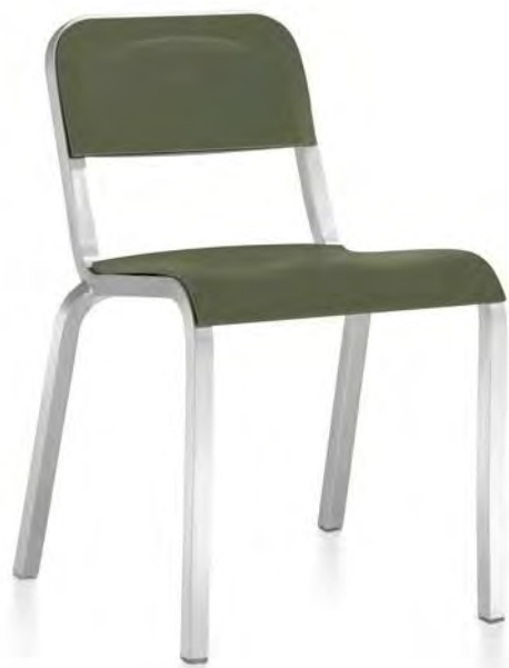
1951 by BMW, 2005 80% recycled aluminum with recycled PET seat.