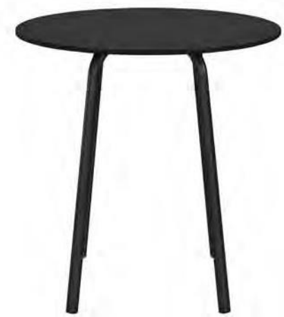
Parrish by Konstantin Grcic, 2013 Recycled aluminum, solid wood, HPL or laminate plywood tops; recycled aluminum frame, clear sand blasted or black powder coated.