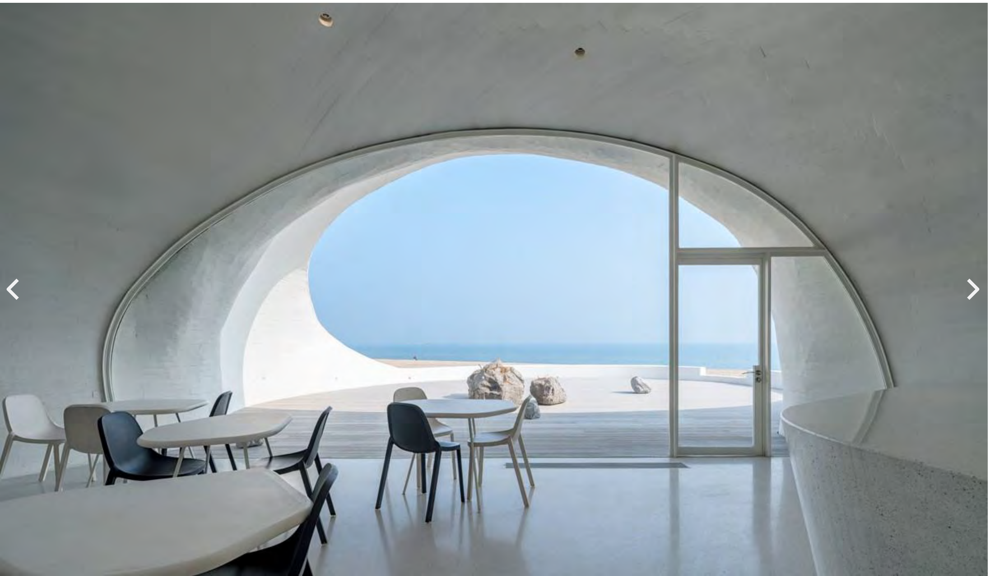
UCCA Dune Art Museum, Qinhuangdao, China. By: OPEN Architecture. Featured products: Broom Stacking Chair