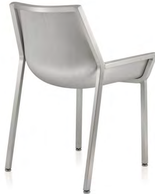
Sezz by Christophe Pillet, 2012 80% recycled aluminum. Made-to-order.