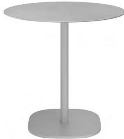
2 Inch Flat Base Collection by Jasper Morrison Recycled aluminum, solid wood, HPL or laminate plywood tops; with aluminum frames.