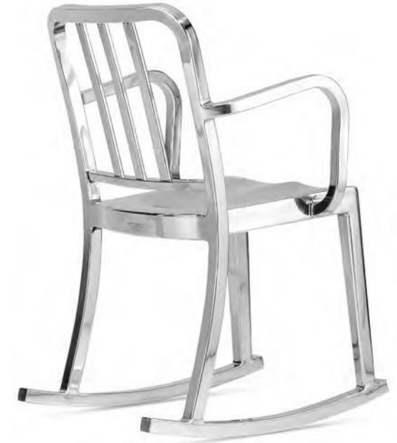
Heritage by Philippe Starck, 2001 80% recycled aluminum. Made-to-order.