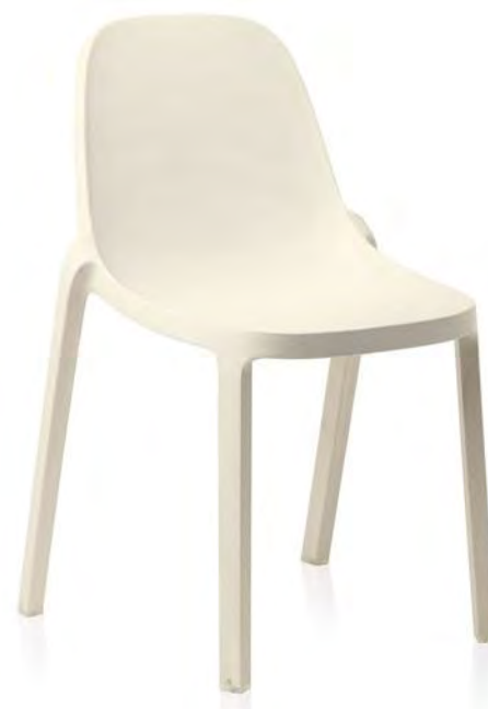
Broom by Philippe Starck, 2012 90% reclaimed industrial waste: wood polypropylene.