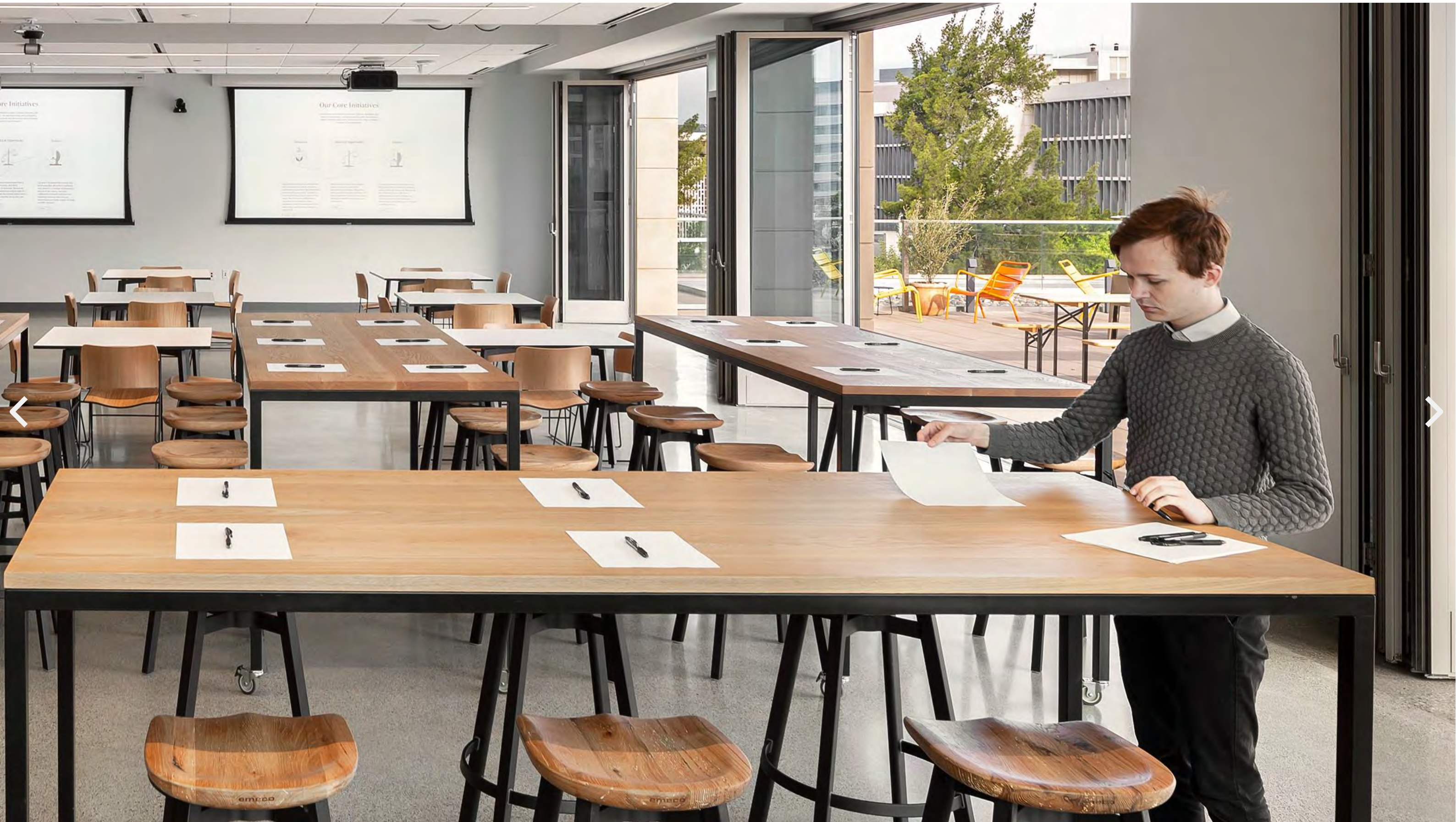
Chan Zuckerberg Institute, San Francisco. By: HBM Hogue. Featured Products: Su Barstool