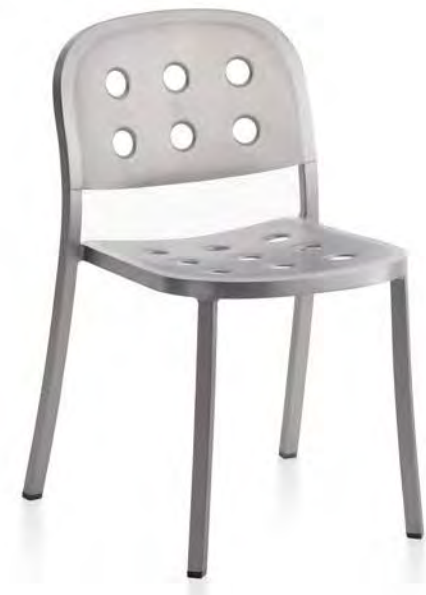
1 Inch All Aluminum by Jasper Morrison, 2018 80% recycled aluminum.