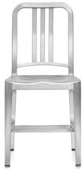
1006 Navy by Emeco, 1944 80% recycled aluminum.