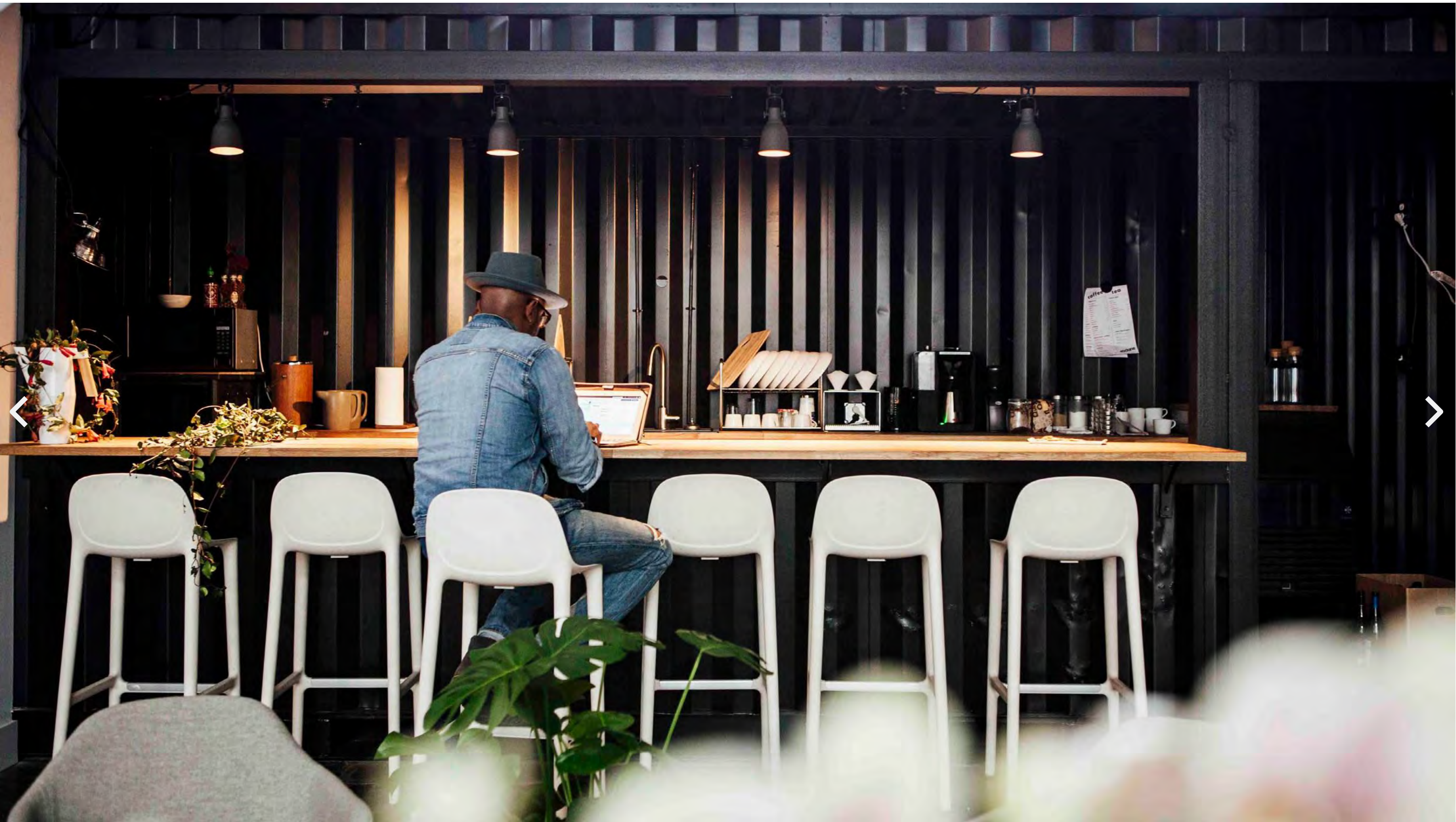
Elevator Factory, Atlanta. Featured Products: Broom Barstool