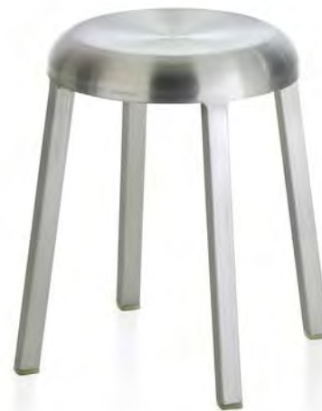
Za by Naoto Fukasawa, 2021 80% recycled aluminum.