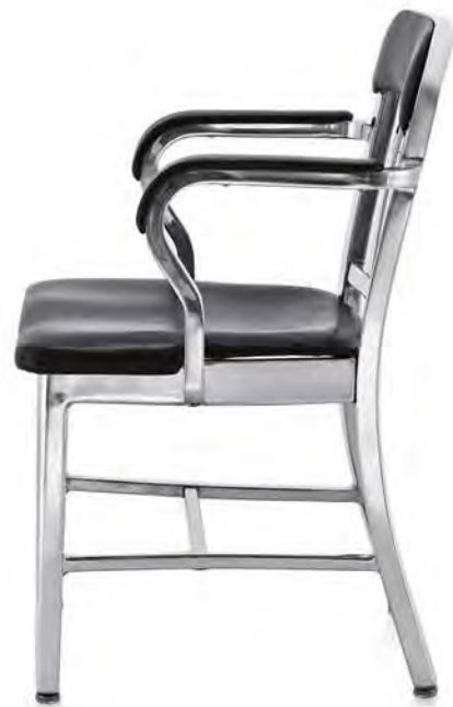
Classic Semi-Upholstered Navy Officer by Emeco, 1948 80% recycled aluminum with upholstered seat. Made-to-order.