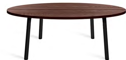
Run Round Table by Sam Hecht + Kim Colin, 2020 . Solid ash or walnut tops with aluminum frames.