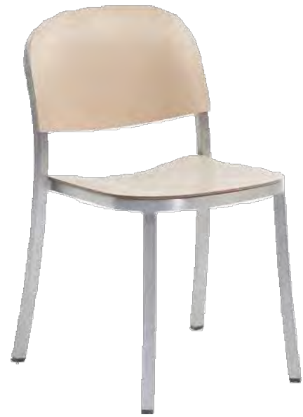
1 Inch by Jasper Morrison, 2017 80% recycled aluminum with 100% reclaimed wood polypropylene, upholstered or plywood seat.