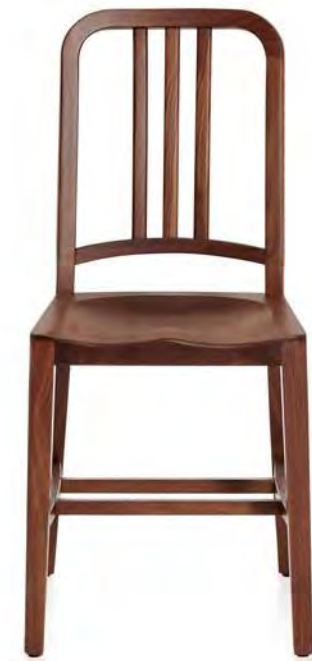
Navy Wood by Emeco, 2019 Solid, sustainably sourced walnut and oak.