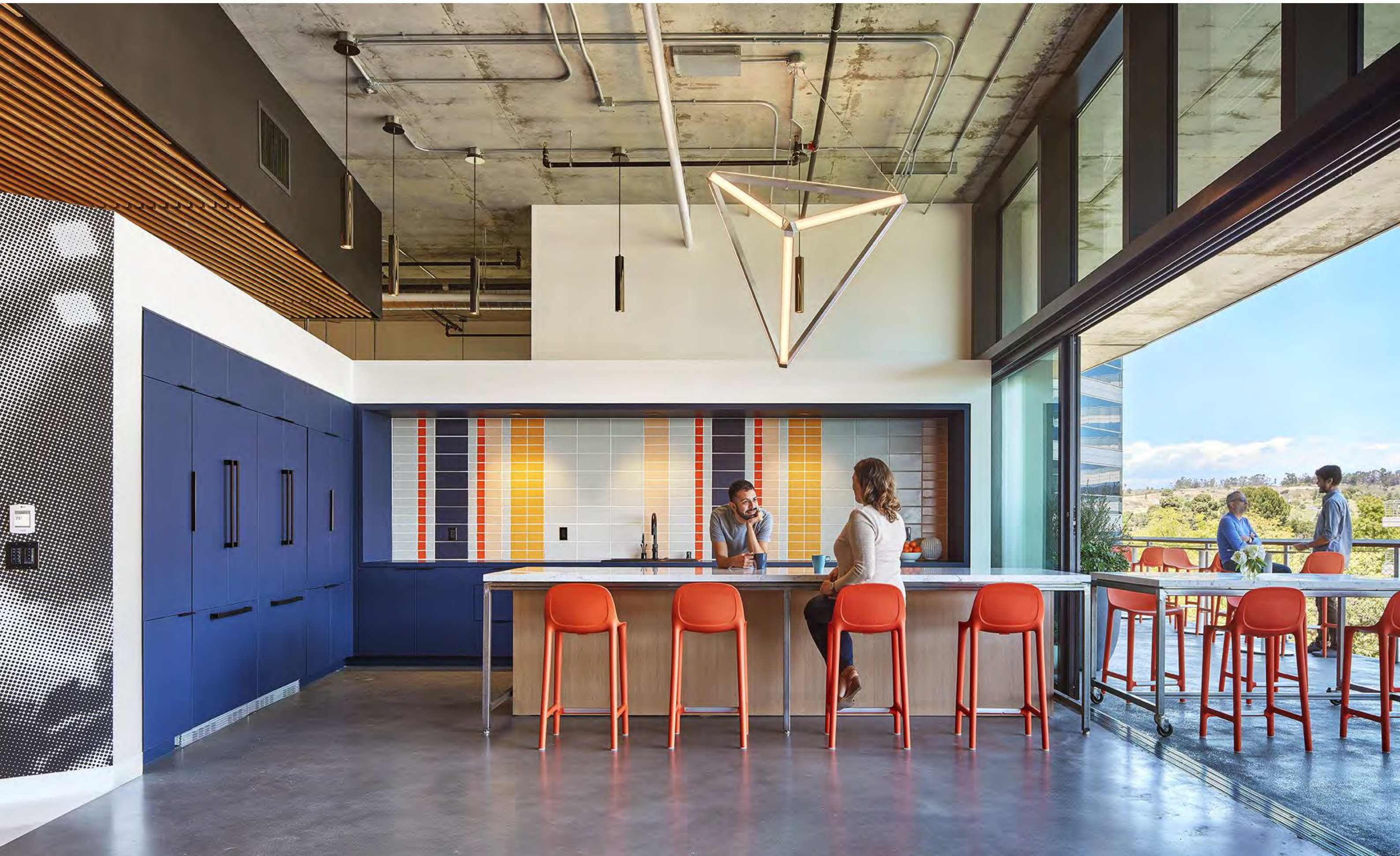
Red Light Management, Culver City, CA Architect: ODAA Featured products: Broom Counter Stools