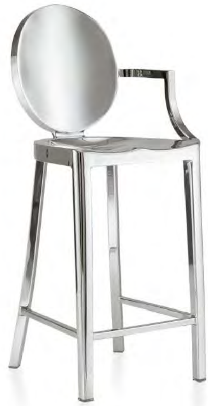
Kong by Philippe Starck, 2003 80% recycled aluminum. Made-to-order.