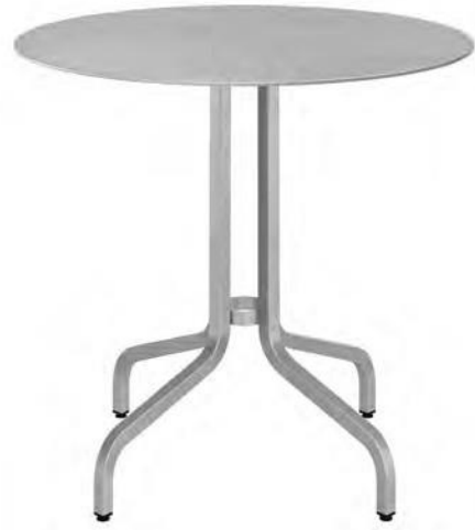
1 Inch Collection by Jasper Morrison, 2017 Recycled aluminum, solid wood, HPL or laminate plywood tops; with aluminum frames.