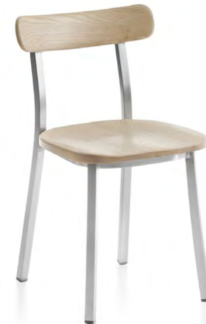
Utility by Jasper Morrison, 2022 80% recycled aluminum. Solid wood seat & back.