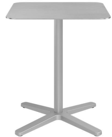
2 Inch X Base Collection by Jasper Morrison, 2021 Recycled aluminum, solid wood, HPL or laminate plywood tops; with aluminum frames.