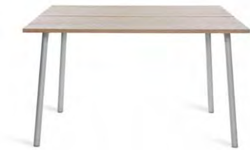
Run Collection by Sam Hecht + Kim Colin, 2016 . Recycled aluminum, ash or walnut tops; with aluminum frames.