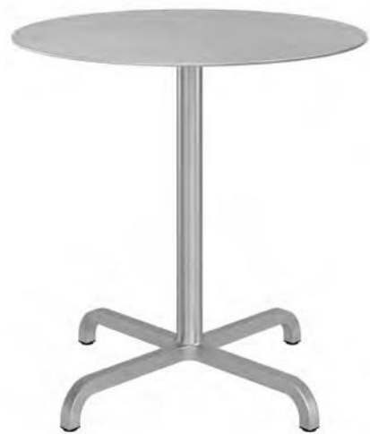
20-06 by Norman Foster, 2006 Recycled aluminum, solid wood, HPL or laminate plywood tops; with aluminum frames.