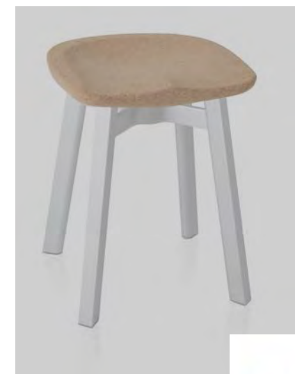
SU by Nendo, 2014 Recycled aluminum with reclaimed oak wood, recycled polyethylene or eco-concrete seat.