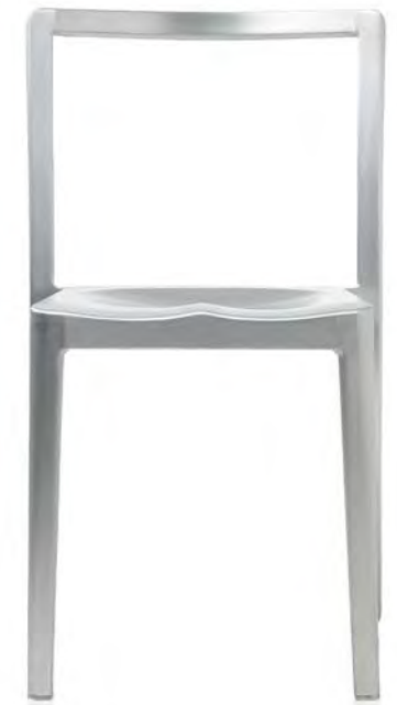
Icon by Philippe Starck, 2004 80% recycled aluminum. Made-to-order.