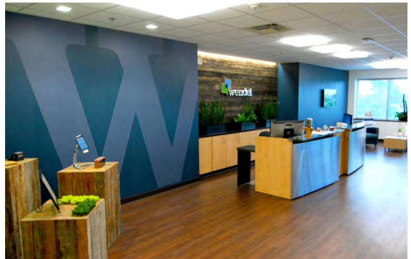
WENDEL'S CORPORATE HEADQUARTERS