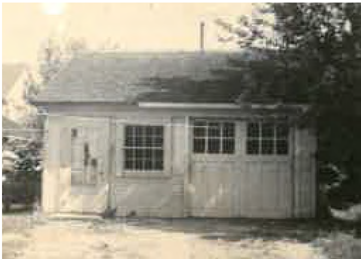
LEON WENDEL'S OFFICE CIRCA 1940