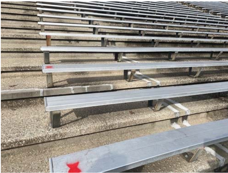
An overview of the home bleachers.