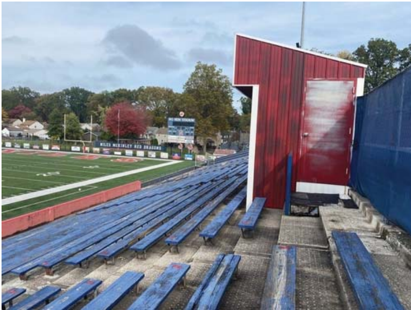
An overview of the visitors bleachers.