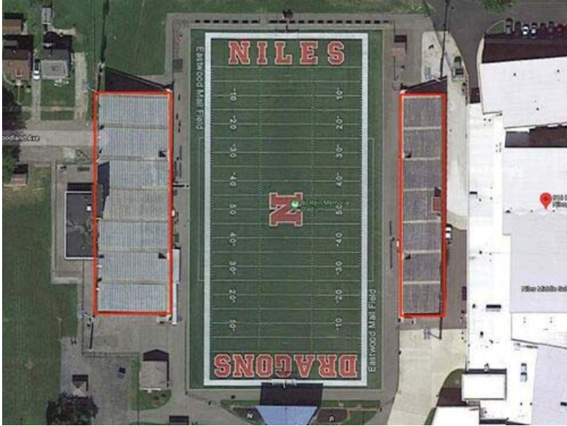
An aerial view of the stadium. The bleachers covered under this proposal are outlined in Red.