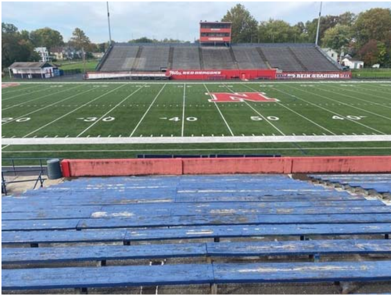
An overview of the visitors bleachers.