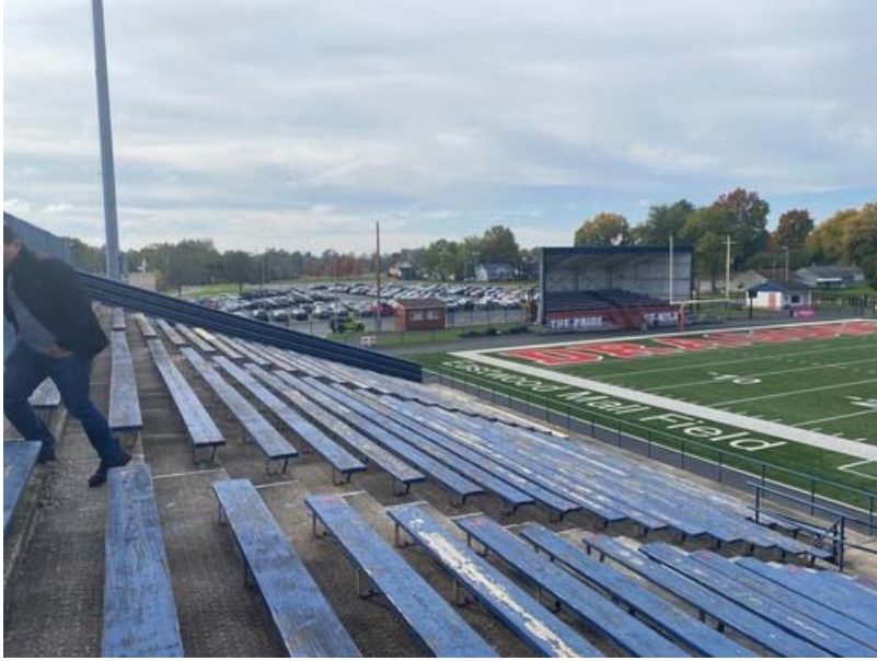
An overview of the visitors bleachers.