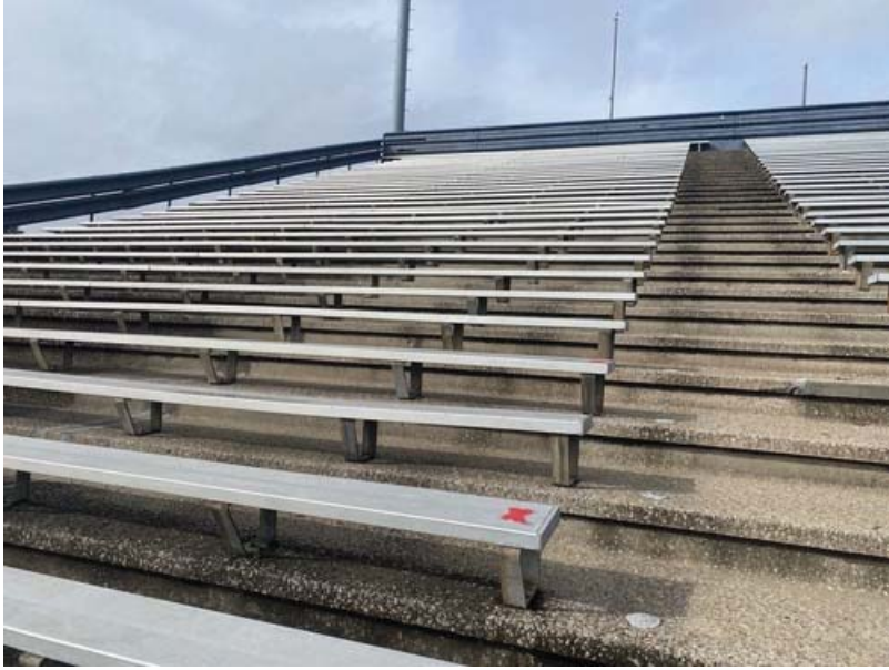
An overview of the home bleachers.