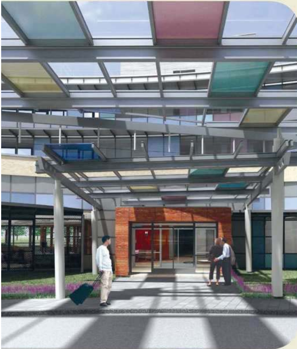
An artist's rendering of the entrance to the Army's $36.9 million lodge in Wiesbaden illustrates an ultra-modern design scheme that has heads turning in that traditional German city. Graphic by Architekten SFS GmbH. Page 12