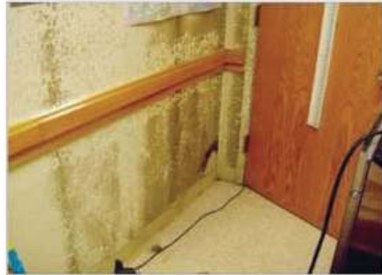
Before treatment, this barracks room wall is covered with mold.