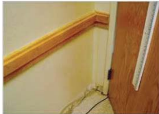
After the room was treated with the hydrogen peroxide gas process, the same wall shows the mold and mildew have been eliminated.

also been used by the Navy, the Federal Emergency Management Agency, the National Historical Society, Lamar University, the Texas Educational System and the Army Corps of Engineers.