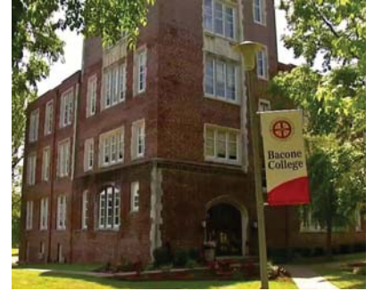
Bacone College: Upgrade of HVAC systems with ClimateMaster; and Air Side Products(ASP) and upgrading building temperature control from antiquated thermostats to the Cloud.

It is like a magnet that attracts, captures, and kills the pollutants in water . Unlike other submicron filters, Force Field™ Filters have very little pressure drop making them the perfect choice for most plumbing applications.