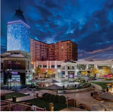
The Gateway, multi-use: Shopping, Restaurants, Hotel, Apartments/Condo, and Entertainment.