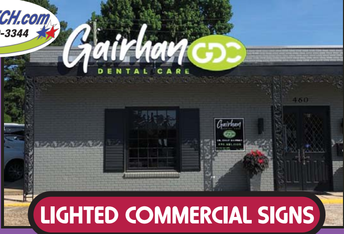
LIGHTED COMMERCIAL SIGNS