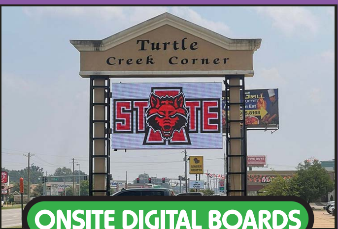
ONSITE DIGITAL BOARDS