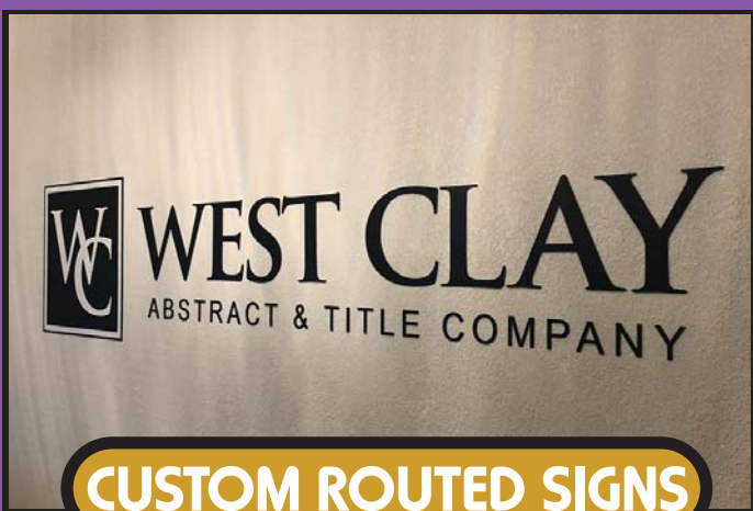
CUSTOM ROUTED SIGNS