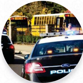
TOTAL CAMPUS COVERAGE