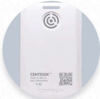
ONE BUTTON ACTIVATION EMPOWERS EVERYONE

The CrisisAlert™ solution includes the following benefits and features.