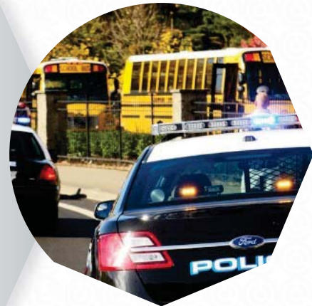
CAMPUS ALERT KEEP CLICKING