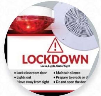
AUDIO & VISUAL NOTIFICATIONS COMMUNICATE TO EVERYONE