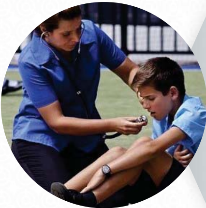
STAFF ALERT 3 CLICKS

The CrisisAlert™ badge activates two types of alerts: