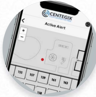
LOCATION INFORMATION SAVES RESPONSE TIME