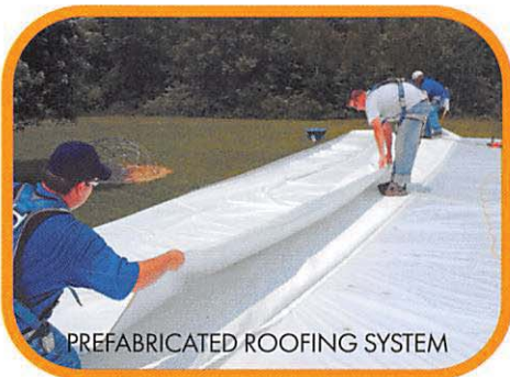
PREFABRICATED ROOFING SYSTEM