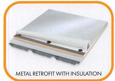
METAL RETROFIT WITH INSULATION