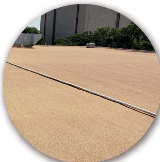
SR Collins - Prairie View A&M