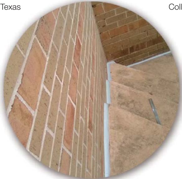
Mitchell Physics Building Texas A&M University