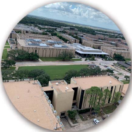
Teague Building - Texas A&M University