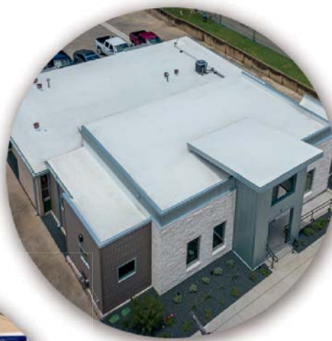
Wellman Insurance Brenham, Texas