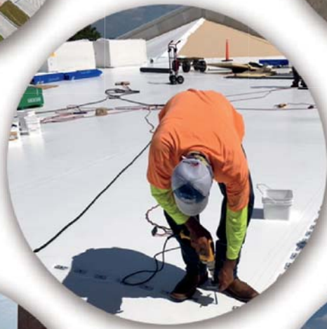
J.B. Coleman Library Prairieview A&M