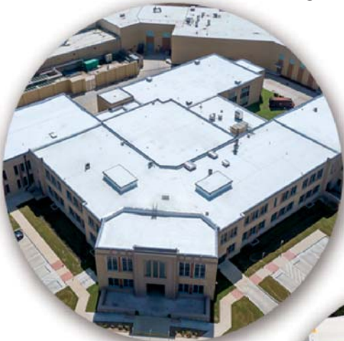
Bryan ISD Bryan, Texas

Single Ply Roofing can provide a cost savings for the building owner as well as it being energy efficient and durable.