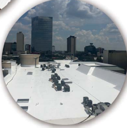
Midtown Edge Condos Houston, Texas