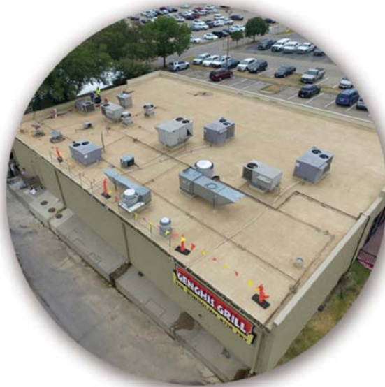
Genghis Grill - College Station