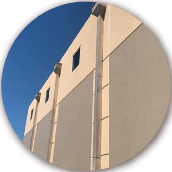
Boys & Girls Club Brenham, Texas

Many of our roof leak calls turn out to be common waterproofing issues that we can fix! We can seal your brick, expansion joints and windows- we can add a color or make your building look just the same!