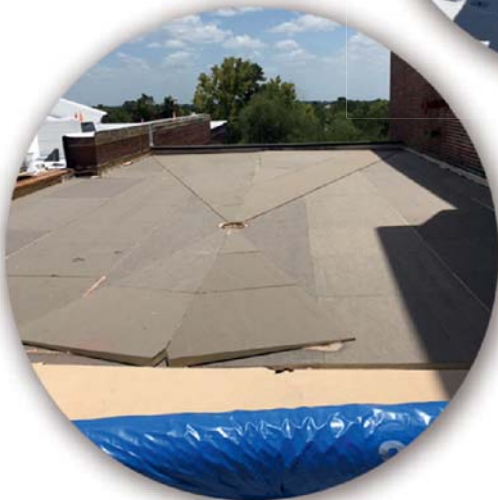
Davis Player Development Building Texas A&M University