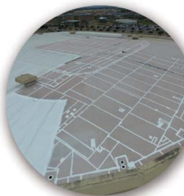
SINGLE PLY RESTORATION