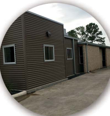
METAL WALL PANELS