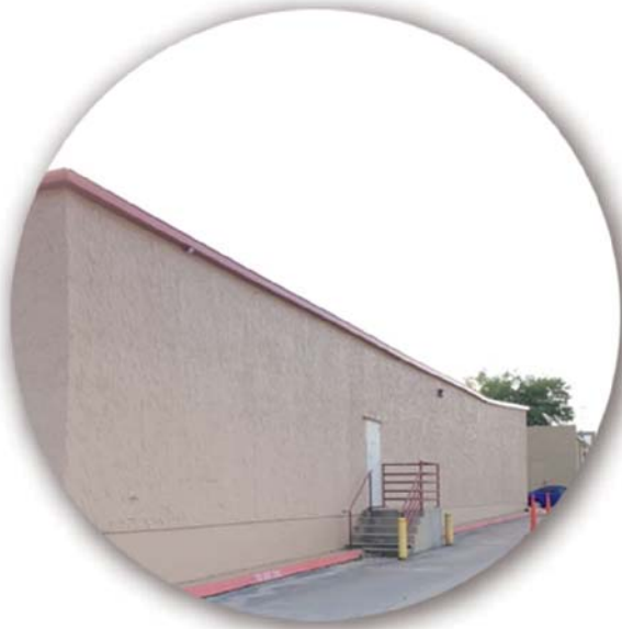
Village Center College Station, Texas