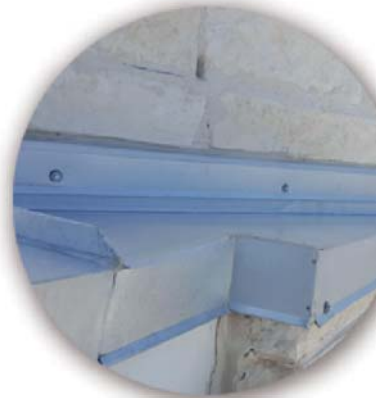
SHEET METAL SERVICE