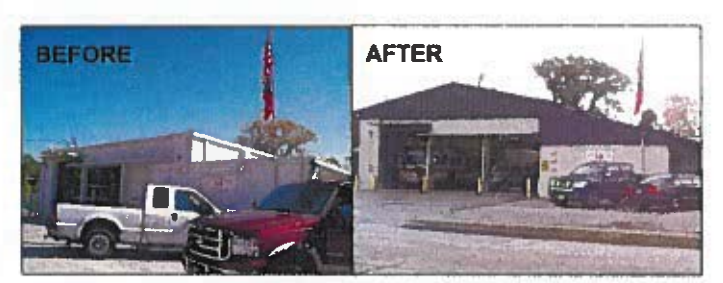
City of Houston Fire Station 38