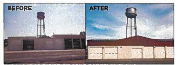
Pilot Point Fire Department