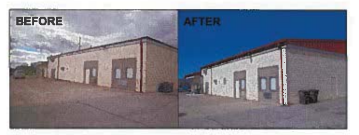
Hondo Community and Senior Center