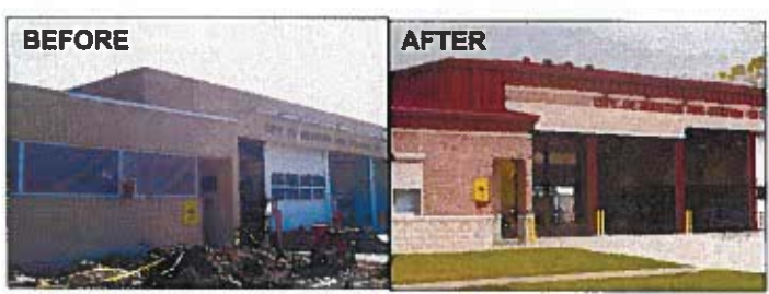
City of Houston Fire Station 29