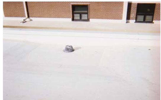
Thomas Jefferson Residence Hall at MO S & T

Thermoplastic Polyolefins are typically fleece backed sheet membranes that are adhered with adhesives to insulation. These products are typically white in color, and may be reinforced. There may or may not be a topping system used on these systems.