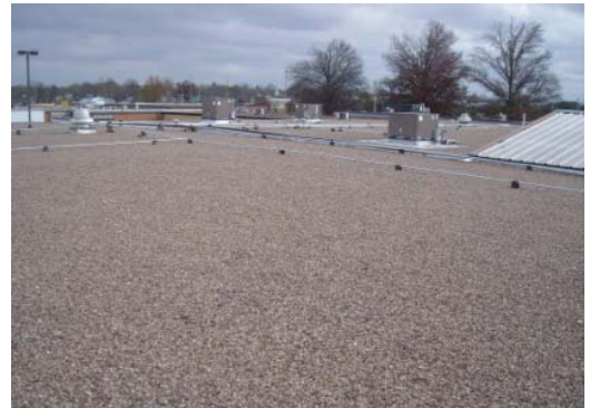
Versailles Middle School

Ethylene Propylene Diene Monomer (M-class rubber) is manufactured into large sheets for application to insulation on a roof. The material can be loose laid and ballasted with rock or pavers to hold the membrane in place. It can also be fully or partially adhered as well. Seams and the membrane are adhered with contact adhesives, with seams sometimes sealed with a sealant. Toppings may or may not be required by the manufacturer in many cases. This product is available in black and white. However, black is almost always used.