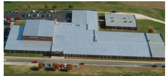
Cassville Schools RMI Coating

At Stiles Roofing we build lasting relationships with our customers by providing the highest quality of service for every phase of their roofs life. From planning & new construction to re-roofing, custom sheet metal work, maintenance & repairs, we have the expertise, the trained personnel, the equipment and the financial strength to provide the highest quality of service to every client we serve.