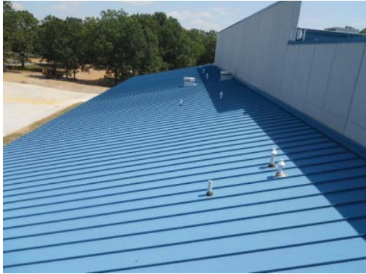
(/uploads/6/2/4/0/6240870/1295643126.jpg) Mountain View/Birch Tree Middle School