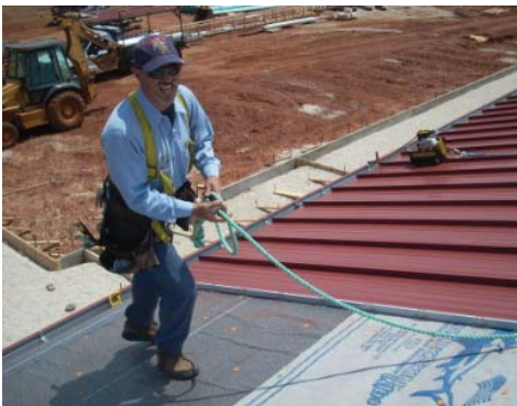
New Willard Elementary - During Construction