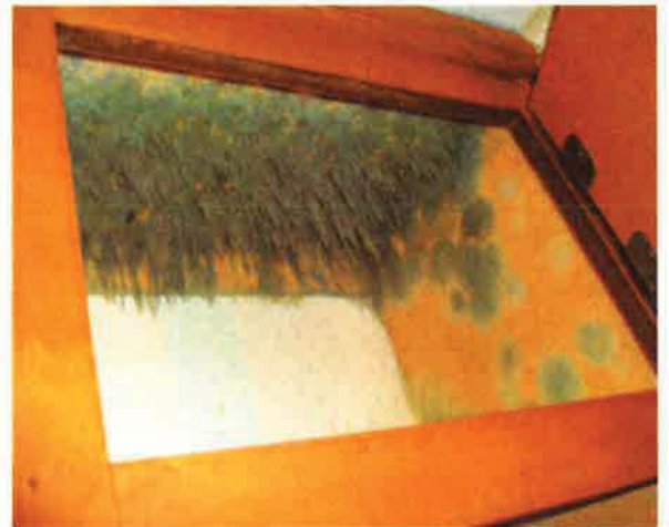
Example of a bloom from the Aspergillus/Penicillium Mold within kitchen cabinets. Extensive fungal growth can become favorable when the following conditions exist: moisture source, food source, lack of ventilation (airflow) and lack of ultraviolet light.