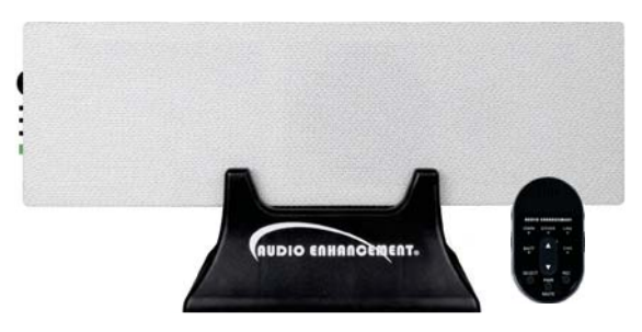
BEAM Configuration w/Power Base