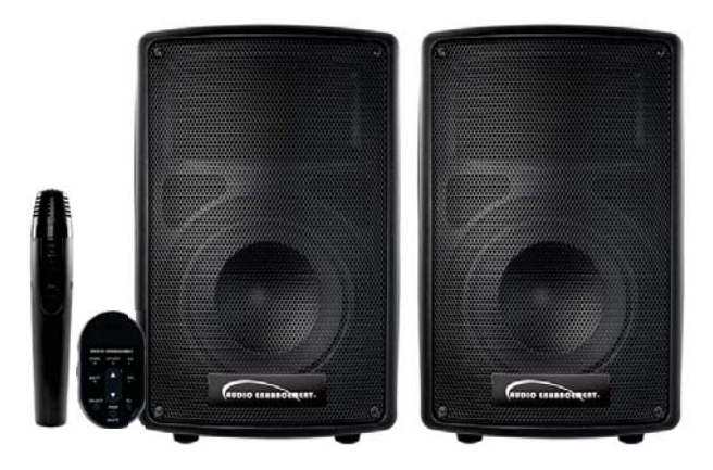
XDSolo Pal System w/Companion Speaker