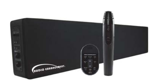
Cart- and Wall-Mount Configuration