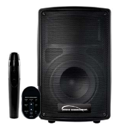
XDSolo Pal System