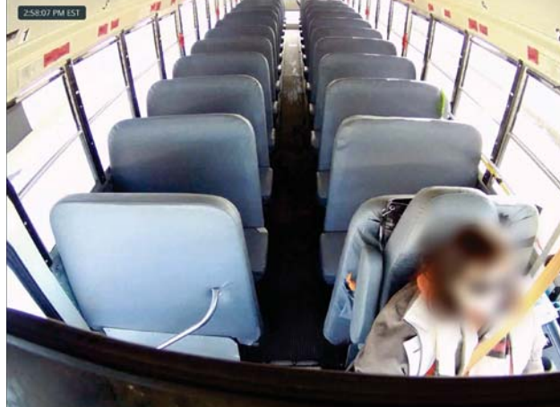
Pictured: View from Verkada CD41 installed on school bus.