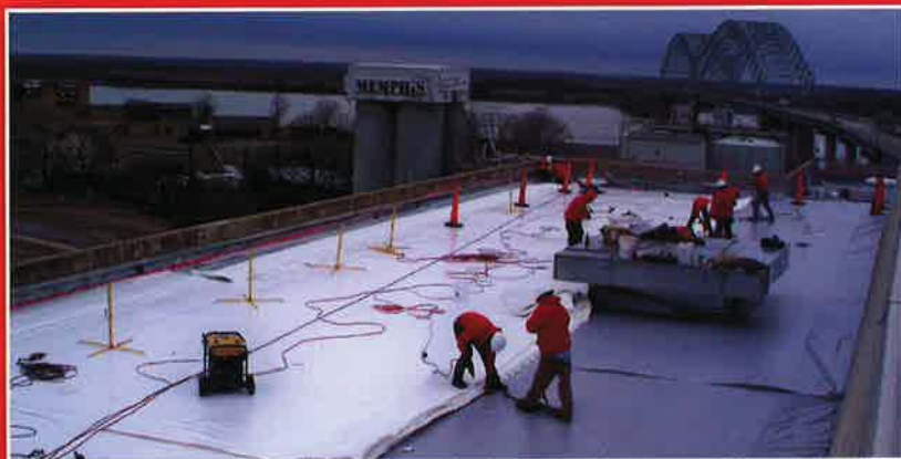
Memphis Cook Convention Center – Memphis, Tennessee