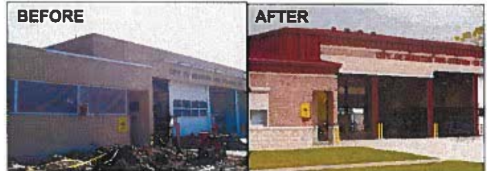
City of Houston Fire Station 29