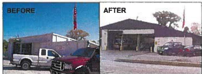
City of Houston Fire Station 38