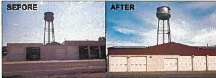
Pilot Point Fire Department

IN-HOUSE DESIGN • ENGINEERING • MANUFACTURING • INSTALLATION