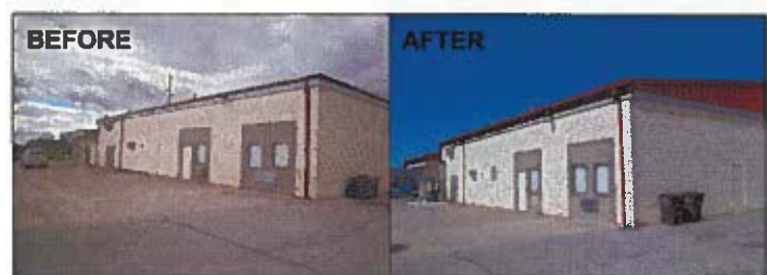
Hondo Community and Senior Center