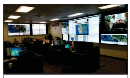
The 115<sup>th</sup> Fighter Wing can rely on E-Logic to design, install, program, integrate and manage its entire war room.

One solution does NOT fit all. Our Subject Matter Experts