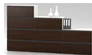
Steel Lateral Filing & Storage