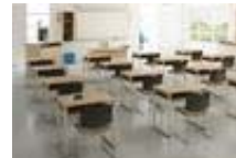
Think Smart Educational Furniture