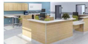
Harmoniä Healthcare Furniture