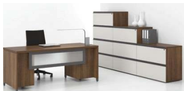
Laminate Lateral Filing