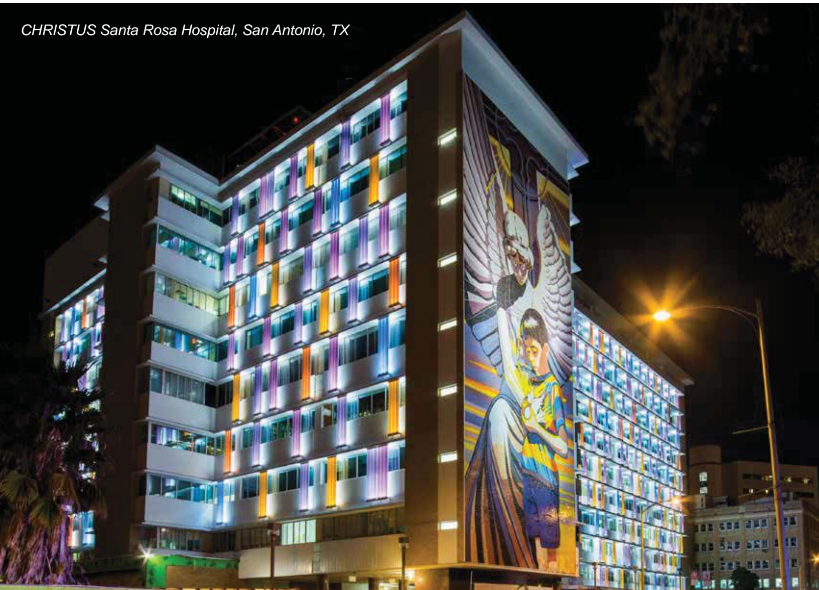
CHRISTUS Santa Rosa Hospital, San Antonio, TX